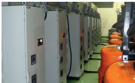
Access 400 chargers built up of Access 100 modules, 80 V 400 A, batteries 930 Ah