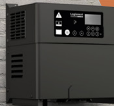
OFF BOARD BATTERY CHARGER