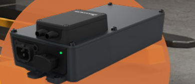
ON BOARD BATTERY CHARGER