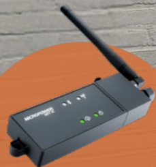
REMOTE BATTERY MONITORING